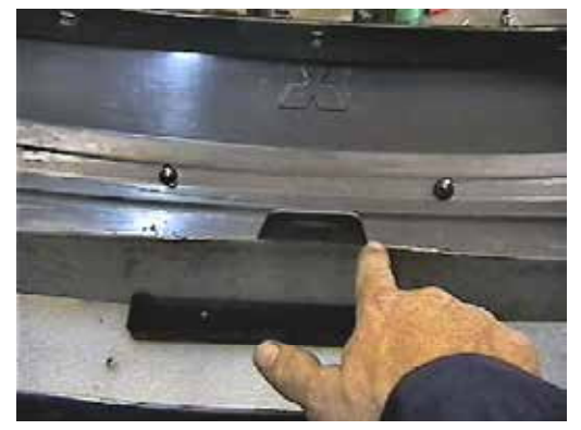
15. Lay fascia face down on a soft surface, remove tab just behind license plate bracket and reinstall fascia, trim as needed.

14. Reinstall metal bumper to its original position. Only the back metric bolt will be able to be used on both sides. Be sure and use loctite on all bolts before tightening. Torque all bolts according to torque chart in General Instructions.